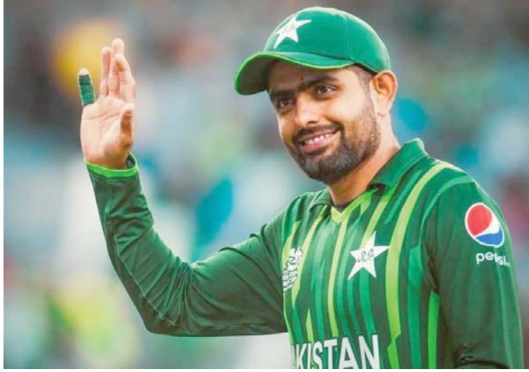
To surpass Virat Kohli's total runs in T20Is, Babar needs only 82 more runs. The current standings are: Virat Kohli: 4037 runs (109 innings), Rohit Sharma: 3974 runs (143 innings), Babar Azam: 3955 runs (110 innings).

This feat would demonstrate his exceptional skill and consistency, as he currently sits third among the highest run-scorers in T20I cricket with 3955 runs, behind only Virat Kohli and Rohit Sharma, as quoted by cricketpakistan.com.pk.