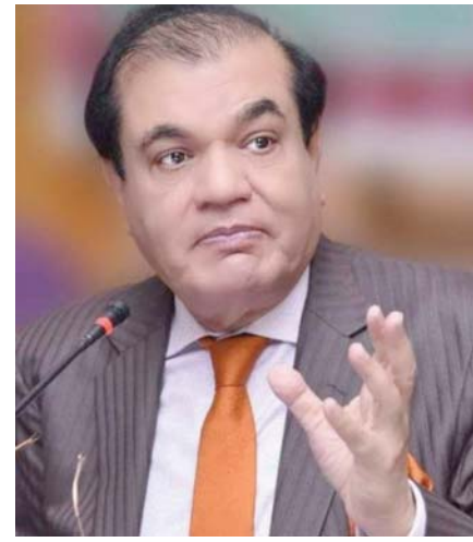
The government should take strict action against various mafias, which will boost the

The business leader stated that the middle class and the poor have grown weary of taking loans, and now they no longer have this option. We should support our political leadership in their efforts to address the worst economic crisis in the country's history.