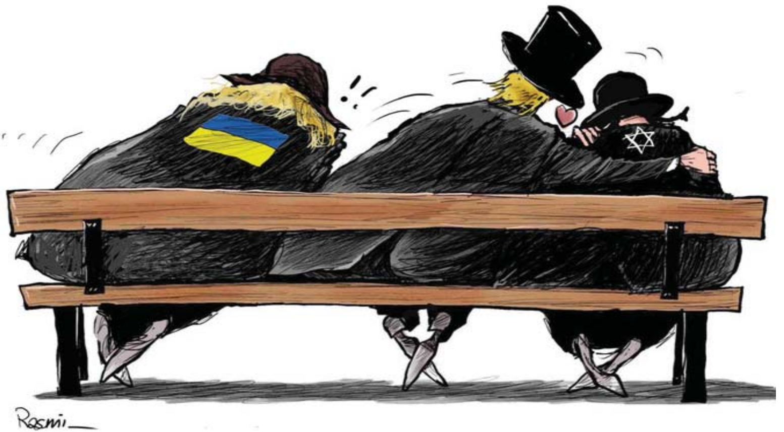
Cartoon by Amjad Rasmi.

As far as the global economy is concerned, it is now forecast to grow by 2.7 per cent in 2024 (an increase of 0.3 percentage points from the forecast in January) and 2.8 per cent in 2025 (an increase of 0.1 percentage points).