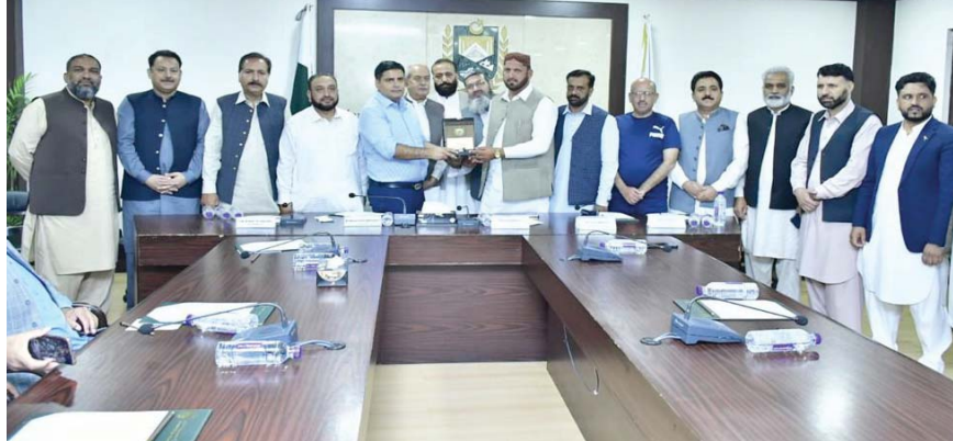
Anjuman-e-Tajraan Bara Kohu.