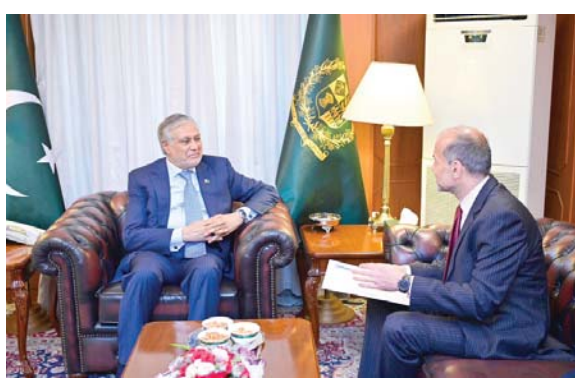
migration. He appreciated Swiss companies doing busi-

Deputy Prime Minister and Foreign Minister Dar said that Pakistan attaches high importance to its ties with Switzerland and the two sides have the potential to expand cooperation in trade and investment, climate, tourism and