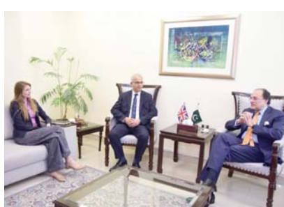
cally driven reform program aimed at fostering economic growth and sustainability in Pakistan.