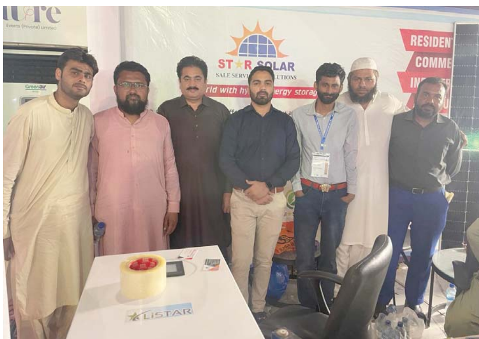
He said a technical exam program should also be started on solar energy and due to these reasons Industry will flourish and Solar Industry can survive for damage. At last he said people should get the advantage of solar items due to decreasing the prices and the Government should fully support networking on solar and energy items.

He said the Power and Fuel Industry are playing a very vital role for Solar. He said that Government should also plan to begin the Solar Degree plan and Licences criteria should be compulsory for Solar Energy Companies because everybody who has no knowledge is coming in solar field and some are misguiding to the people regarding solar items and due to begin these solar program awareness will come among the people and they will purchase right solar things.