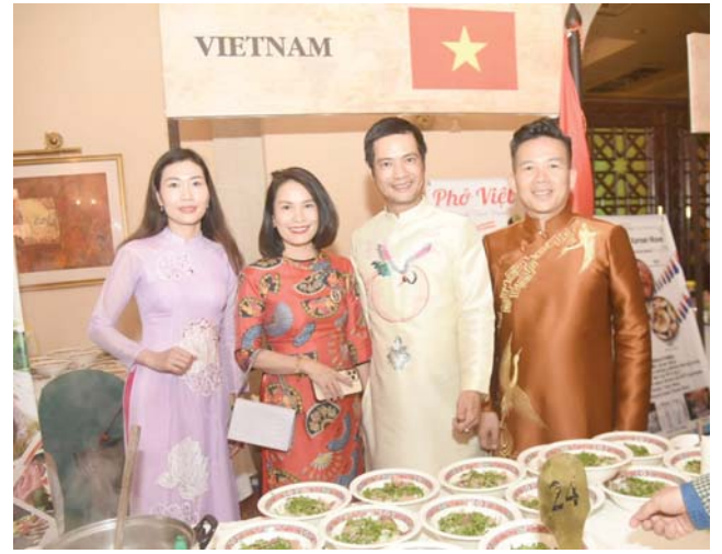
Action Network (IBFAN) after by purchasing equipment for the devastating floods in 2022 mobile Nurturing Care Center.