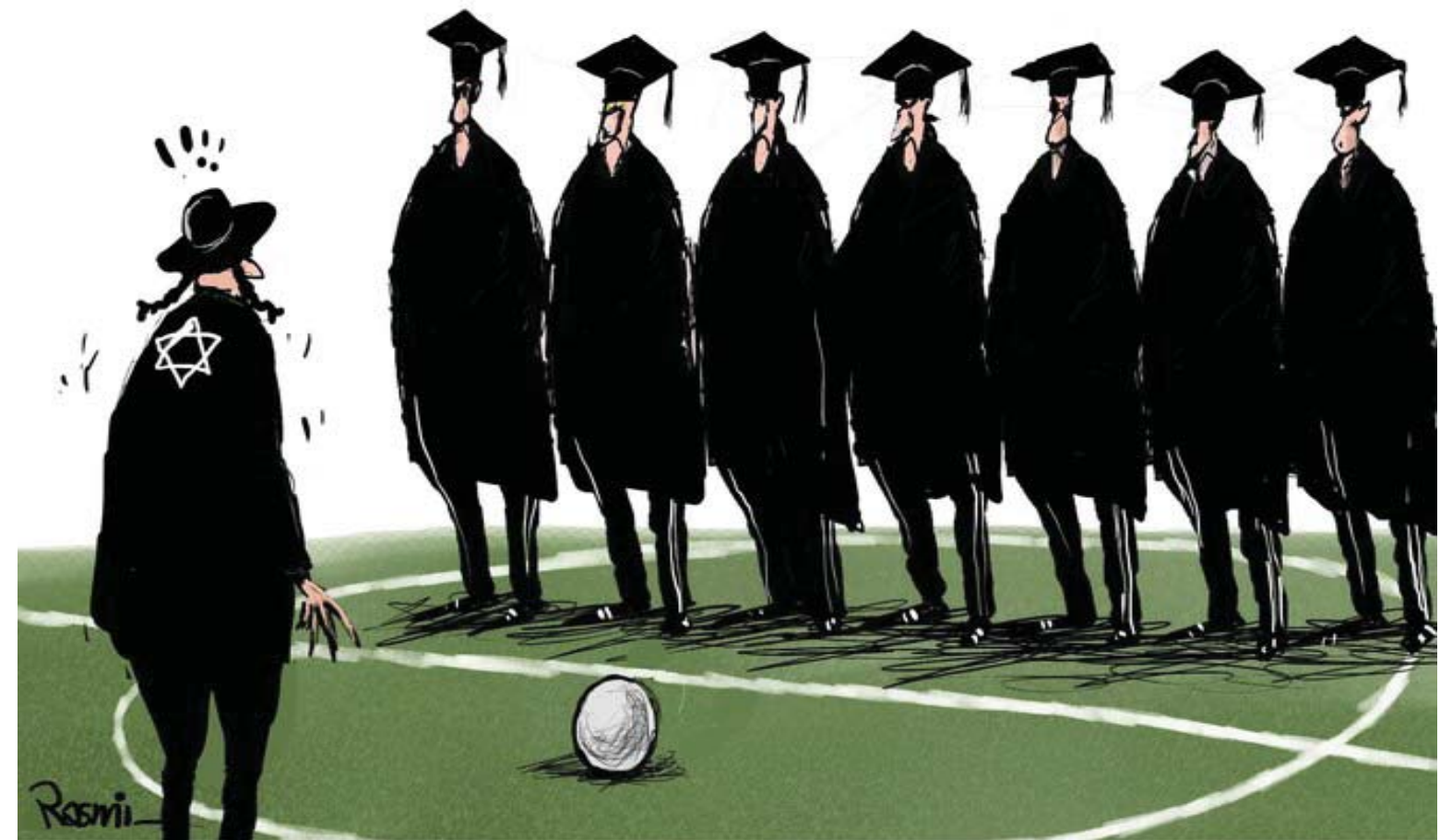
Cartoon by Amjad Rasmi. (Courtesy of Ashraf Al-Awsat)

"We welcome aid delivery by air and sea, but there is no alternative to the massive use of land routes," he said, before again calling on Israel to allow and facilitate safe, rapid and unimpeded humanitarian access throughout Gaza, including for the UN's Palestine relief agency, UNRWA.