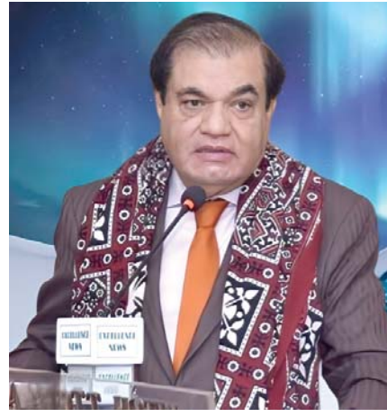
and improvements in the tax system need to be done in order to get out of the chronic payments crisis.

Due to the ignoring merit, the influential are