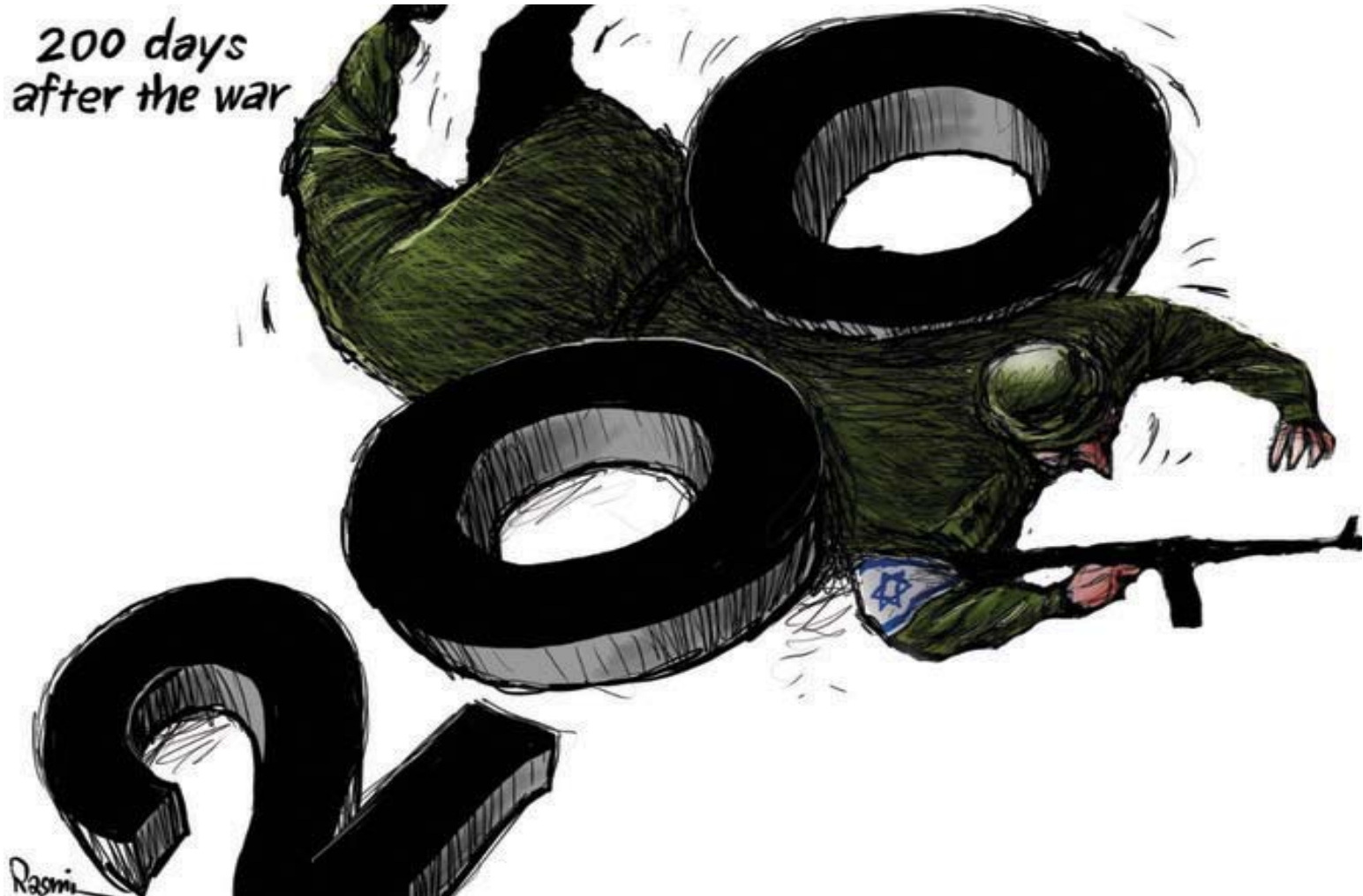
Cartoon by Amjad Rasmi.