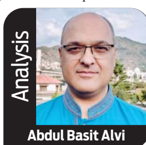
Abdul Basit Alvi

Dear readers, the nation is acutely aware of the malevolent intentions of anti-state elements seeking to tarnish the reputation of our Army. It is imperative to take decisive action against these elements and establish a structured mechanism to curb the dissemination of baseless propaganda lacking evidence and proof.