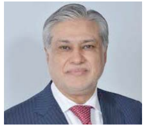
prime minister on his visit to Saudi Arabia.

ISLAMABAD: Prime Minister Muhammad Shehbaz Sharif has designated Minister of Foreign Affairs Ishaq Dar as Deputy Prime Minister. The Cabinet Division had issued the notification of the appointment. At present, the foreign minister is accompanying the