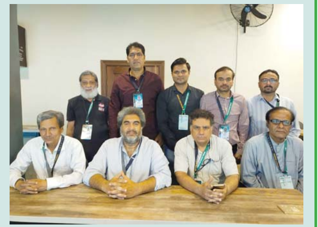
A Group photo of Senior Sports Journalists during the 5th T-20 cricket Match between Pakistan Vs New Zealand at Gazzafi Stadium, Lahore.

In an exciting match, the Kinnaird College Lahore team secured victory in the T10 match by 7 wickets, chasing the target in just 8 overs. LPP extends its heartfelt gratitude to all participants, sponsors, partners, and supporters for their invaluable contributions to making this event a resounding success. The organization looks forward to future endeavors aimed at celebrating women in sports and fostering a culture of inclusivity and excellence.