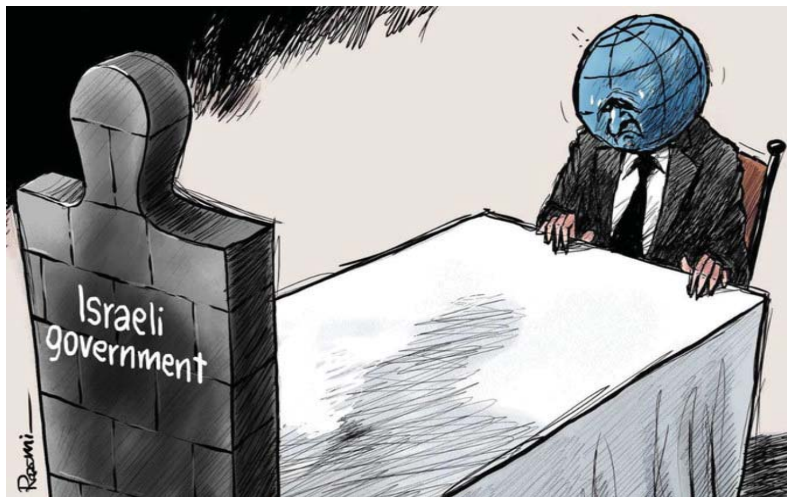
Cartoon by Amjad Rasmi. (Courtesy of Ashraf Al-Awsat)

Terrorism is one of the biggest challenges that Pakistan has been facing. A spike in terror attacks has been observed in the last few months. The stakeholders need to adopt a comprehensive strategy to wipe out the menace of terrorism from its roots. In Balochistan, the dynamics of the terrorism is different as that of in KPK. The government and security forces need to adopt different strategies by leaving no loophole for the terrorists. Unfortunately, there is a nexus of RAW, NDS and TTP and the militants are using Afghan soil for their nefarious designs against Pakistan. In my opinion, Pakistan miscalculated the takeover of Afghan Taliban in Afghanistan. Pakistan must also have signed an agreement with the Afghan government for not allowing use of its soil against Pakistan by the militants. Now the Taliban government is using TTP as a tool to pressurize Pakistan.