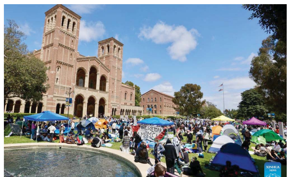
People participate in a pro-Palestinian protest at the University of California, Los Angeles (UCLA), California, the United States, on April 25, 2024. Hundreds of protesters gathered and built a protest encampment in support of Palestinians on Thursday at UCLA, one of the top public universities in the United States.

Despite certain U. S. politicians branding the demonstrators as "anti-Semitic" and the subsequent arrest of hundreds of students, pro-Palestinian demonstrations are spreading on campuses across the United States as the Israel-Hamas conflict in Gaza continues. Xinhua