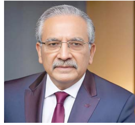
of gas from Iran, it will not matter to Iran, but Pakistan's economy will recover. The business leader said Pakistan is facing