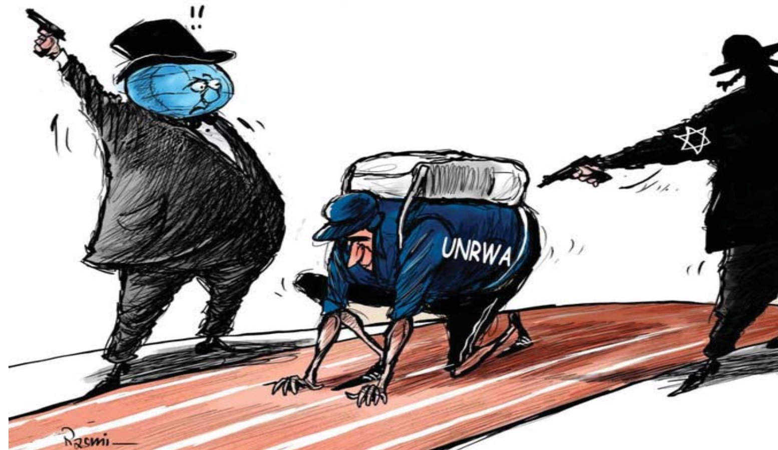
Cartoon by Amjad Rasmi. (Courtesy of Ashraf Al-Awsat)

It is aimed at scaling up vaccination programmes around the world.