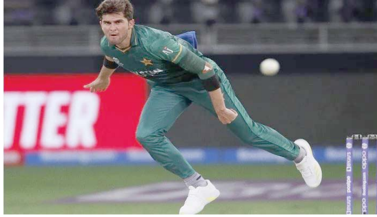
triumph over the Kiwis in the second game of the series has led to the rise up the rankings and past teammate and fellow quick Haris Rauf in 22nd place." The number one spot belongs to

"The pacer took the only wicket in the opening match of the series that was ruined by rain and his haul of 3/13 in Pakistan's decisive seven-wicket