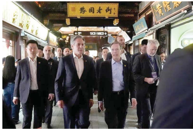
US Secretary of State Blinken and US Ambassador to China Burns walk through the Yu Gardens in Shanghai, China, April 24, 2024.

Blinken will press China to stop its firms from retooling and resupplying Russia's defence industrial base. Moscow invaded Ukraine in February 2022, just days after agreeing a "no limits" partnership with Beijing, and