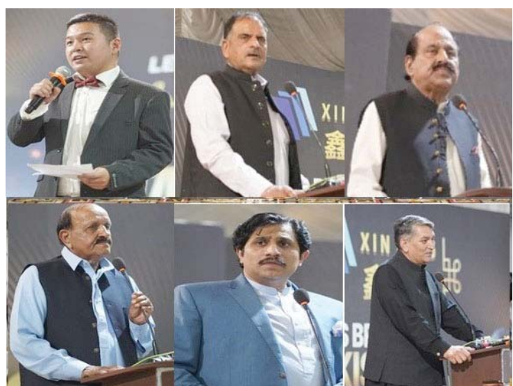
scooters, advancing sustainability efforts. The solar kits provided by Xin Xing include charging units, two light bulbs, and a solar panel, demonstrating the company's commitment to empowering rural families with reliable energy

With a focus on research and development, Xin Xing aims to introduce innovative solutions, including solar-based vehicles, refrigerators, ovens, and electric