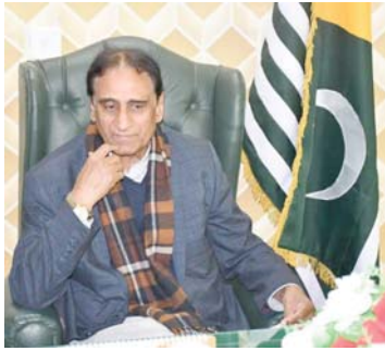
village will become a story. Pakistan is the strong fortress of the world of Islam and the country that wants to have relations with mutual

ISLAMABAD: Speaker of Azad Kashmir Legislative Assembly, Senior Parliamentarian Chaudhry Latif Akbar strongly condemned the alarming situation arising from the continuous bloodshed of innocent freedom fighters in Occupied Jammu and Kashmir and Palestine from the platform of OIC Security Council, called for an emergency meeting and said that if the United Nations and influential countries do not give up the double standard by revising the policies subject to interests, then global peace will collapse and meaningful progress for the global