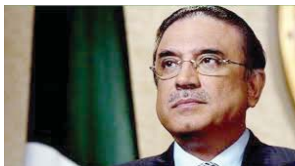
Zardari received majority votes of the electoral college, comprising the parliament and provincial assemblies, paving the way for him to assume the office of President of Pakistan, for the second time in the country's parliamentary history.

Asif Ali Zardari, the joint candidate of PPP and PML-N, was elected as the 14th president of Pakistan.