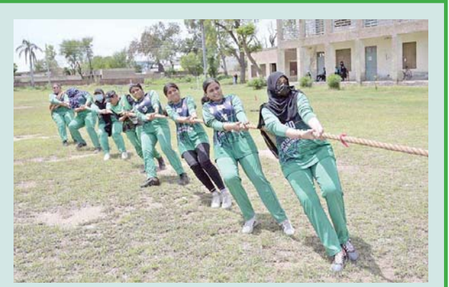
SARGODHA: Players participating in tug-of-war competition during Inter Girls Collegiate Tug-of-War Tournament organized by Education Board Sargodha.

ing was four wickets for 18 runs. The third place is for New Zealand lanky fast bowler Adam Melne who took 26 catches in seventeen matches, after him Pakistan Shaheen Afridi who got 25 wickets in 17 matches. The best bowling is three wickets for 20 runs. Shaheen's father-in-law Shahid Khan Afridi is at the fifth place, who has hunted 21 NZ batsmen at an average of 18.47. His best bowling is four wickets for 14 runs.