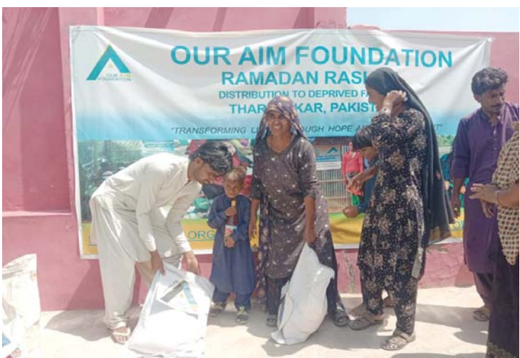
Recognizing the urgent need for assistance, Our Aim Foundation has stepped in to offer support and relief to those most in need.

Tharparkar, known for its harsh climatic conditions and persistent challenges, has long struggled with food insecurity. The recent drought exacerbates the situation, leaving many families without access to an adequate and nutritious food supply.