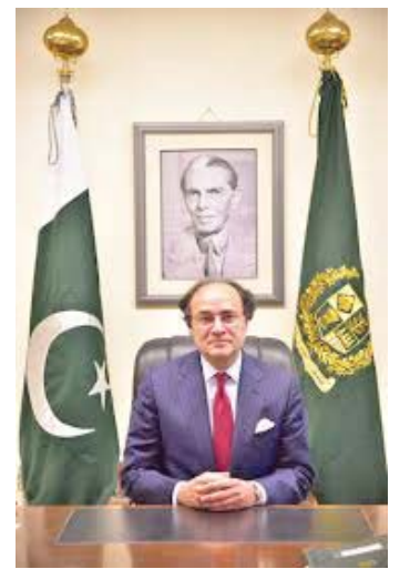
entering into a larger and extended programme with the IMF.

He outlined three important reform areas of taxation, energy and privatization, said a press release issued here. The minister highlighted positive economic indicators including strong performance of the agriculture sector, diminishing inflationary pressures, stable exchange rate, declining trade deficit and strong remittances. He informed that the government was committed to