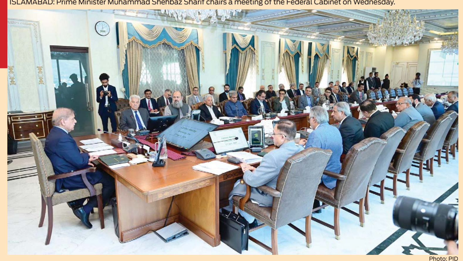
ISLAMABAD: Prime Minister Muhammad Shehbaz Sharif chairs a meeting of the Federal Cabinet on Wednesday.