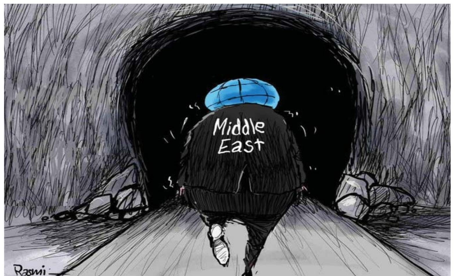
Cartoon by Amjad Rasmi. (Courtesy of Ashraf Al-Awzat)

He said that strengthening development cooperation with Pakistan is the top priority. The latest infrastructure projects include the new international airport at Gwadar Port and the East Bay Expressway. We will continue to promote the implementation of global development initiatives. Pakistan is the first country to sign a document with China on the implementation of global development initiatives, he added. In July last year, the China hosted the first high-level meeting of the Global Action Forum for Shared Development. Prime Minister Shahbaz delivered a speech via video and sent ministerial representatives to attend the meeting.