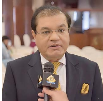
Now the whole Middle East is in the grip of problems. If tensions are allowed to escalate, oil and gas prices will skyrocket, affecting all oil

Talking to the business community, the veteran business leader said that the shipping sector was already affected by Yemeni militants, and business costs had increased.