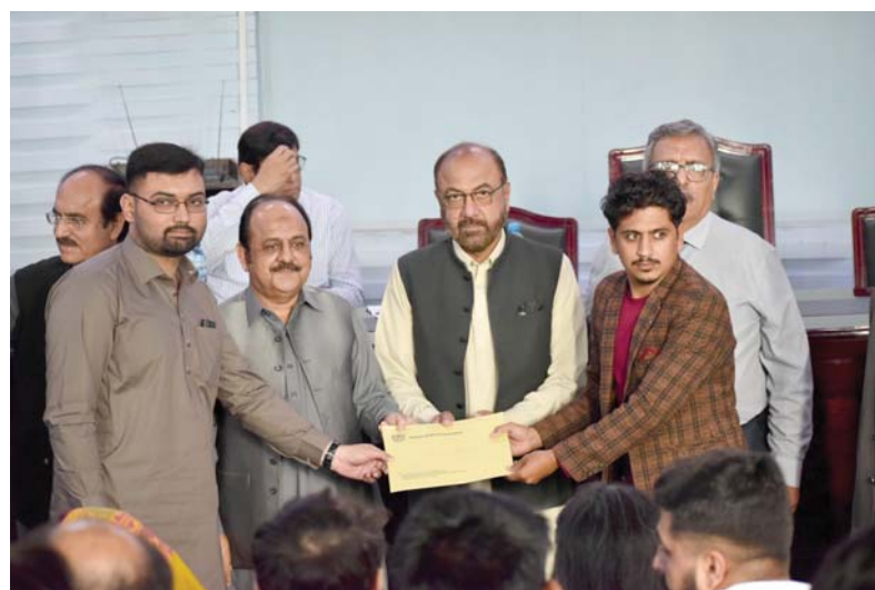
the initiatives being taken by the council in the Governing Body Tenure (2021-24).