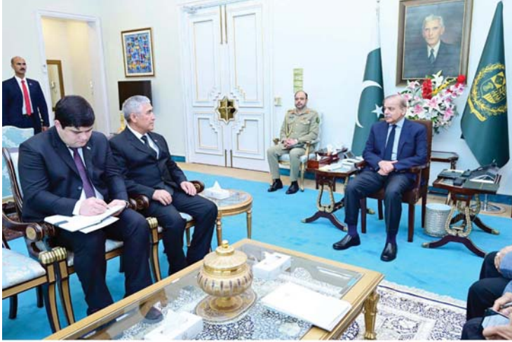
Islamabad: Ambassador of Turkmenistan H. E. Atadjan Movlamov calls on Prime Minister Muhammad Shehbaz Sharif on Wednesday.

The prime minister expressed his views during a meeting with Ambassador of Turkmenistan Atadjan Movlamov who paid a courtesy call on him at the Prime Minister House, PM Office Media Wing said in a press release. During the meeting, cooperation on regional initiatives was also highlighted. In this regard, the prime minister stressed that high level exchanges between the two countries needed to be enhanced. The importance of regular