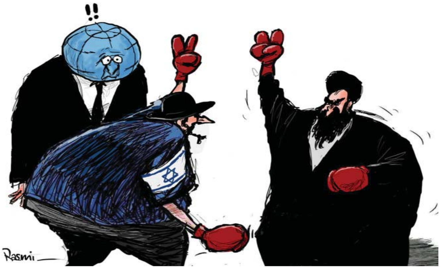
Cartoon by Amjad Rasmi.