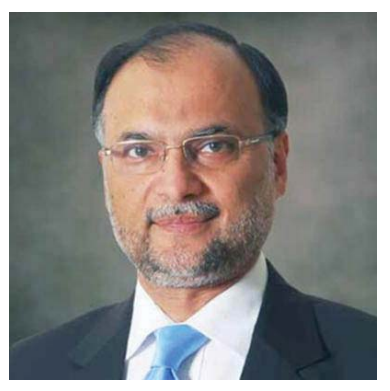
"Today, Pakistan's name is not prominent in the Asian Games as it used to ucts.

The minister also spoke about Pakistan's performance at the Asian Games in Hangzhou, last year wherein it only