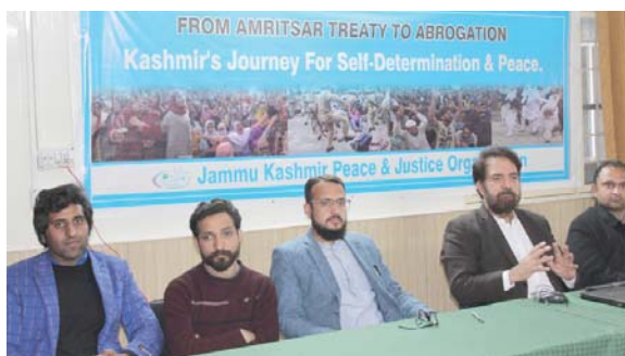
man repercussions of the Treaty of Amritsar, signed on March 16, 1846 between the British East India Company, and Ranjit Singh, head of the Sikh kingdom of Punjab. The speakers highlighted how this infamous agreement, orchestrated by colonial powers and regional actors, perpetuated decades of slavery, exploitation and marginalization under

The seminar, held in two sessions, shed light on the harrowing history and ongoing struggles of the Kashmiri people, highlighting the inhu-