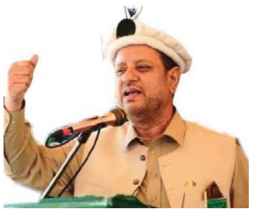
ing the recent elections in Pakistan.. President Muslim Conference Sardar Atiq Ahmad Khan said that the sacrifices of the people of Occupied Kashmir will not go in vain and India will have to account for its atrocities. Narendra Modi's brutal policies have put South

President Muslim Conference Sardar Attique Ahmad Khan discussed in detail the latest situation of Azad Kashmir and Occupied Kashmir, includ-