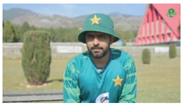
went a comprehensive training regime tailored to elevate their fitness levels, agility, leadership, strategic thinking and overall performance on the field.

Under the guidance of experienced trainers and coaches, the players under-