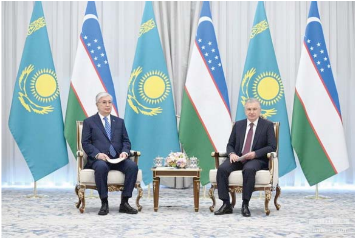
engineering, energy, transport, mining, textile and food industries. The presidents gave specific instructions to increase trade turnover, develop an industrial cooperation program and implement infrastructure projects

The heads of states also listened to reports from the Deputy Prime Ministers on the progress of joint projects in various fields, such as mechanical