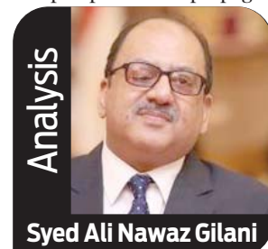
Analysis Syed Ali Nawaz Gilani

The recent developments in Pakistan-China relations underscore both the opportunities and challenges inherent in this strategic partnership. While the reopening of the Khunjerab border signifies resilience and cooperation, security concerns pose formidable obstacles to economic development and regional connectivity, particularly within the ambit of CPEC. As Pakistan navigates these complexities, addressing security imperatives, fostering inclusive growth, and mitigating grievances will be crucial in sustaining the momentum of bilateral cooperation and realizing the shared vision of prosperity and stability in the region.