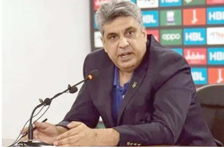
The camp commenced on March 26 and will conclude on April 8. New Zealand are slated to reach Pakistan on April 14 for the crucial series, leading to the ICC Men's T20I World Cup.

Notably, the Pakistan cricketers are currently participating in the physical fitness camp, organised in collaboration with the Pakistan Army, to prepare for the upcoming five-match home T20I series against New Zealand.