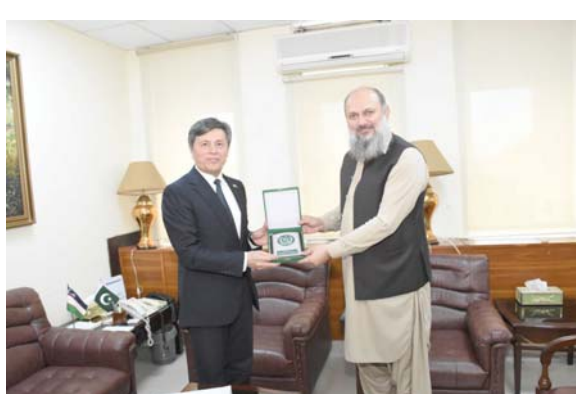
Stressing the longstand- Pakistan and Uzbekistan, necessity of bolstering ing friendly ties between Usmanov emphasized the economic cooperation across

Usmanov praised Minister Jam's experience in politics and expressed confidence in his ability to enhance bilateral trade.