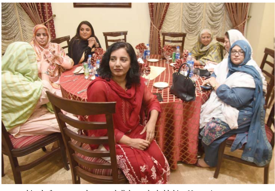
we use this platform to send ans and all those who hold this Nowruz! our congratulations to all Irani- ancestral celebration. Happy