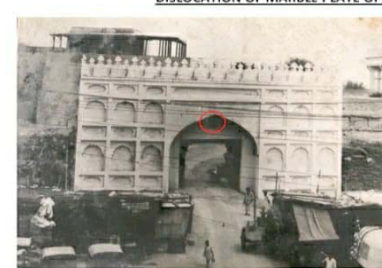
DISLOCATION OF MARBLE PLATE OF MAIN GATE OF PUKKA FORT, HYDERABAD

HYDERABAD: Hyderabad is the second-largest city in the Sindh province and has the honor of being the former capital of Sindh in the past. The city holds significant national and cultural heritage sites or ancient relics, such as the Pakka Qila (Solid Fort), Kacha Qila (Mud Fort), or the smaller forts, among which lies the tomb of the founder of Hyderabad city, Mian Ghulam Shah Kalhoro. These ancient sites, particularly in Hyderabad, are rapidly deteriorating due to negligence and corruption, leading towards rapid decay. While the major sites like Pakka Qila and Kacha Qila have been fully under control, their walls are crumbling rapidly, indicating a dire situation where in a few years, these forts' mention might