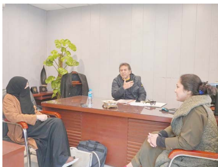
With 60% of Pakistanis under 35, there's a growing need for mental health and SEND support

Founded and funded by the Care-Tech Foundation, PSEI addresses the significant challenge in Pakistan, where an estimated 1 in 4 people face mental health or disability-related issues.