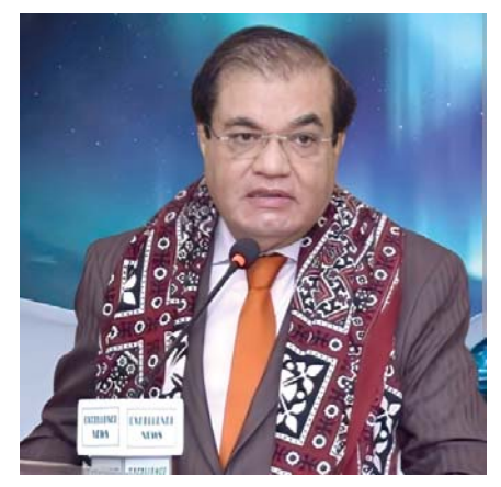
sions under pressure. He is now faced with the challenge of the success of the current IMF The new finance minister is respected in review and signing a new IMF program soon

financial circles and can make tough deci- after the budget.