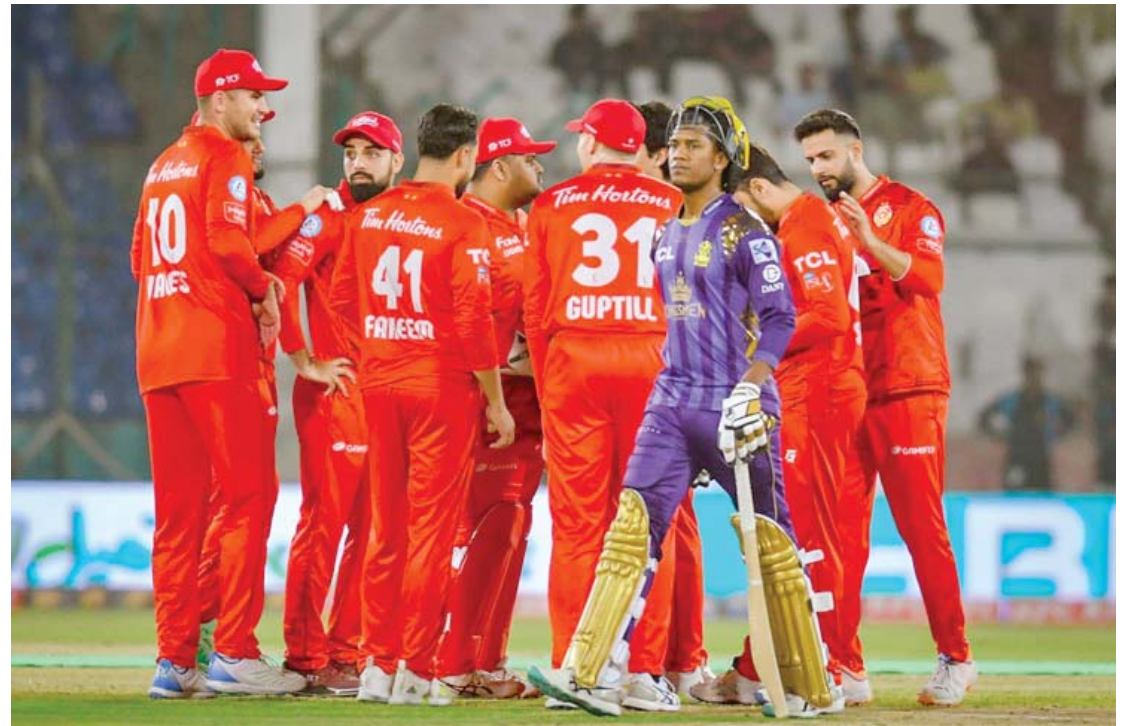
Peshawar Zalmi in the Eliminator 2 on Saturday in a bid to make their way to the PSL 9 final.

It is worth mentioning here that the winner of the Eliminator 1 will take on