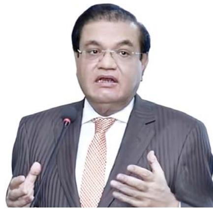
this situation can only continue for a short time, so there is a need to reduce the expenses. Transparency in the salary and pension system, elimination of ghost employees, sale

Mian Zahid Hussain said that the salaries are currently being paid by taking loans, and