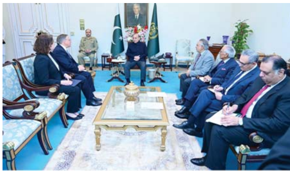
ISLAMABAD: US Ambassador to Pakistan Donald Blome calls on Prime Minister Shehbaz Sharif in Islamabad on March 15, 2024.

The PM expressed satisfaction with the present state of bilateral relations. He stressed the need for maintaining the positive momentum by "regular convening