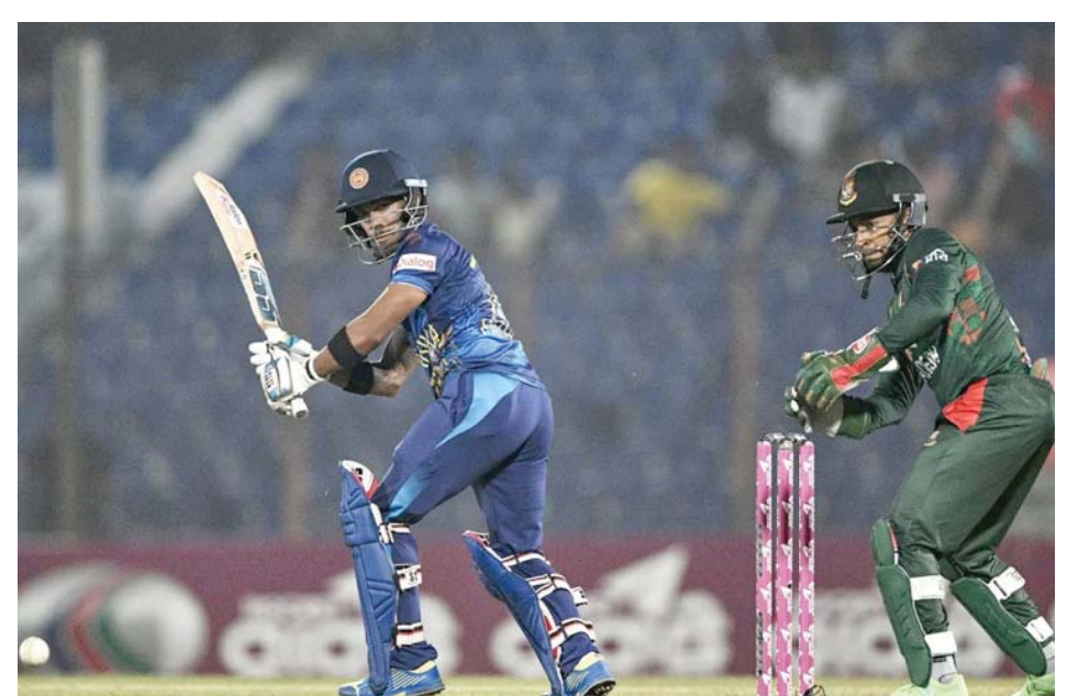
three-match series against Bangladesh. The two sides will square off in the final ODI on Monday.

The three-wicket victory meant Sri Lanka levelled the