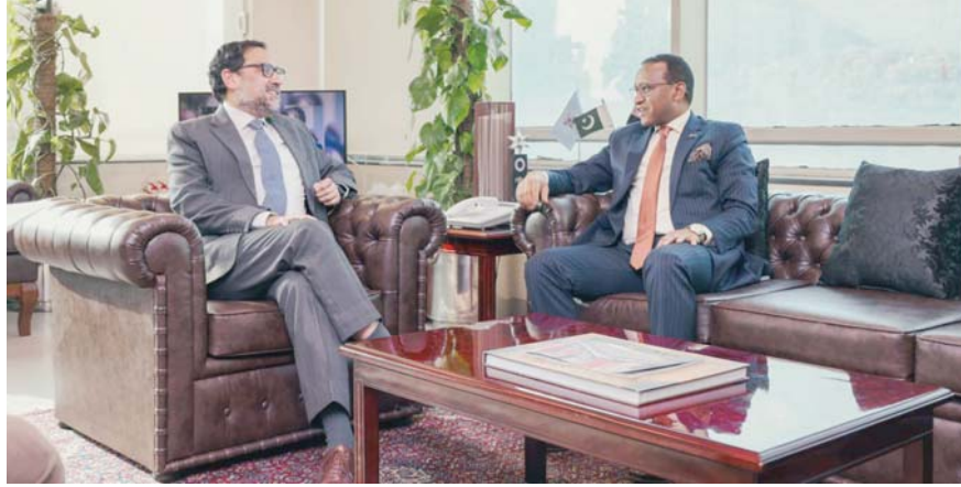
The Ambassador briefed the Secretary on the pivotal role being played by the Ethiopian Airlines in effective implementation of the "Look Africa and Engage Africa" policies of Pakistan that were aimed at strengthening government-to-government, people-to-people and business-to-business relations between both Pakistan and African countries.