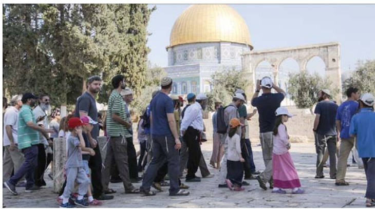
law and the obligations of the occupying power towards places of worship

ISLAMABAD: The Ministry of Foreign Affairs and Expatriates condemns in the strongest terms all the measures and procedures of the Israeli occupation in Jerusalem in general and in the vicinity of the blessed Al-Aqsa Mosque, in order to prevent and obstruct the arrival of worshippers to the mosque, including installing iron barriers on 3 doors of the mosque, in an attempt to introduce more changes to the historical and legal reality. And the political presence in the Holy Mosque, in a flagrant violation of international