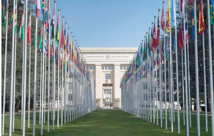
the people's rights to privacy.

Calling the Personal Information Protection Law enacted in 2021 in China "a milestone," Gong said the law provided a comprehensive legal framework for the protection of personal information and thus helped protect