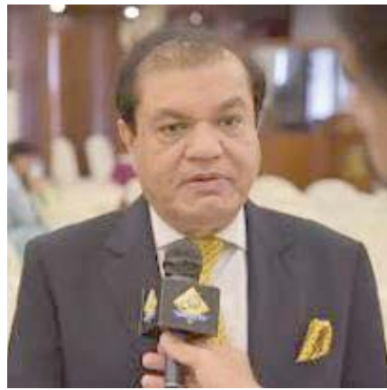
slogans, is committed to working hard and has a good reputation.

Talking to the business community, the veteran business leader said that Ishaq Dar is a responsible politician who, instead of raising