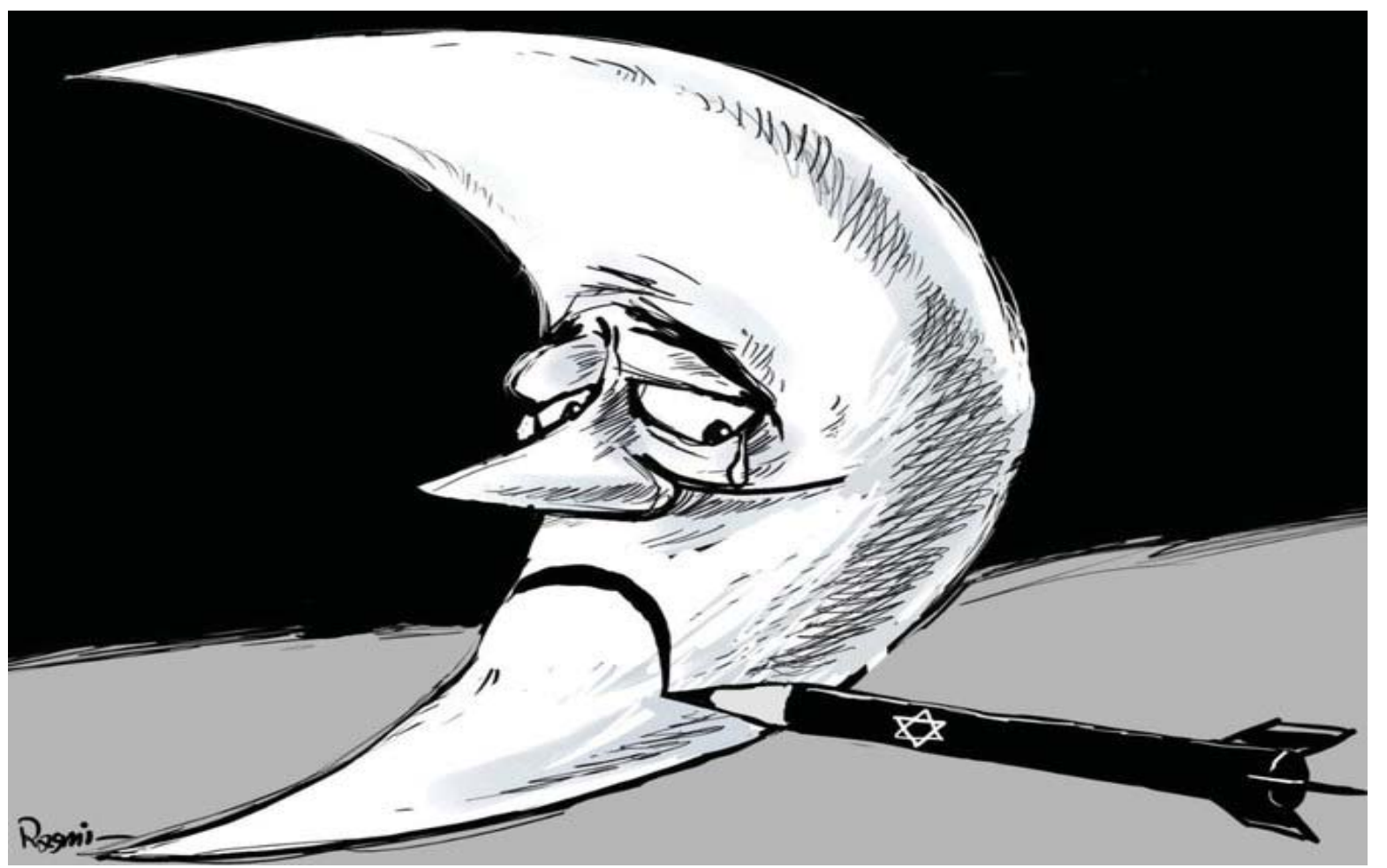
Cartoon by Amjad Rasmī.