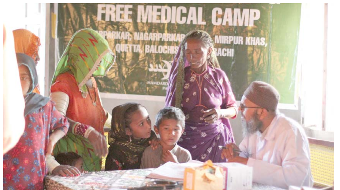
an example of the welfare and goodness of humanity in the spirit of service to humanity in the past and in the future.

This initiative of Hamdard Foundation Pakistan was greatly appreciated by the local population. Special prayers were offered for the success of Hamdard Foundation Pakistan, which has been