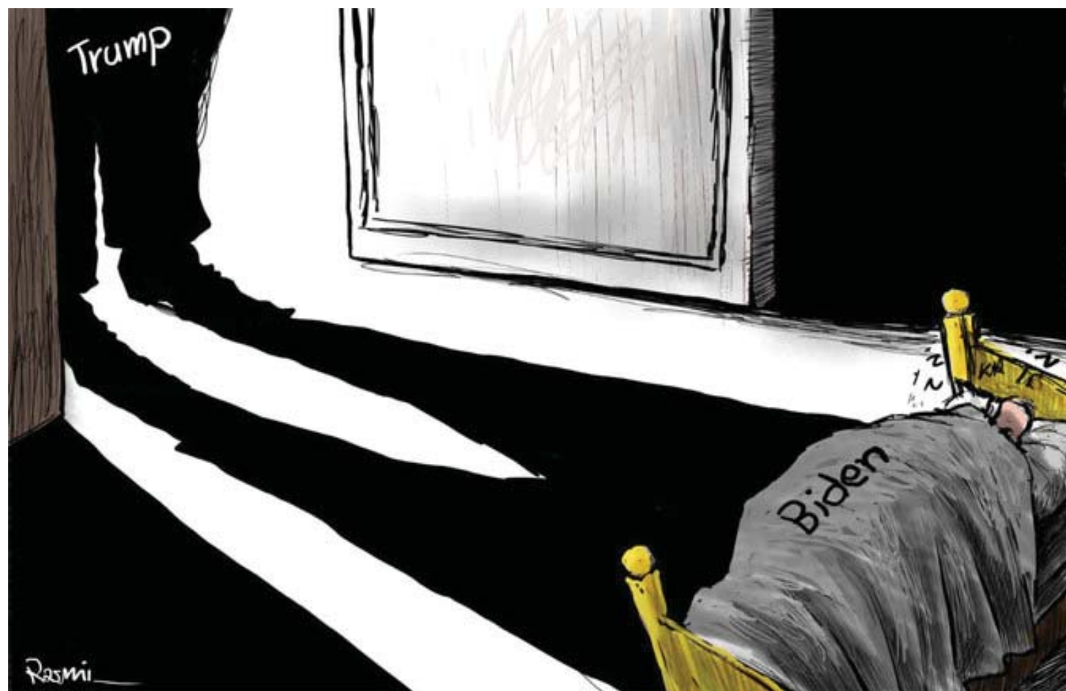
Cartoon by Anjad Rasmi.