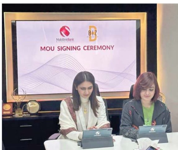
selling preloved apparel but will also enjoy the full range of features provided by the

ISLAMABAD: Mobilink Bank partnered with BizB, a leading marketplace in Pakistan, welcoming the company as a 'Brand Ambassador Organization,' to drive financial inclusion and bolster women micro-entrepreneurs nationwide. This symbiotic partnership strives to offer easily accessible financial services and support the endeavours of female entrepreneurs in the growing e-commerce landscape. Through this partnership, women micro-entrepreneurs under BizB's W-Empower will not only have access to a platform for buying and