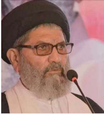
of people." He said that the social, economic

MULTAN: Quaid Millat Jafariya Pakistan Allama Syed Sajid Ali Naqvi in his message on the beginning of the holy month of Ramazan 1445 AH, describing the virtues and characteristics of this holy month in the Holy Quran, said that God has said, "The holy month of Ramazan is that month. In which the Holy Qur'an was revealed, which is a guidance for the people. It is said that "Ramazan is called Ramazan because it burns away sins. Similarly, Hazrat Fatima Zahra, the daughter of the Holy Prophet, said, "Allah Almighty has made fasting obligatory in order to strengthen the sincerity