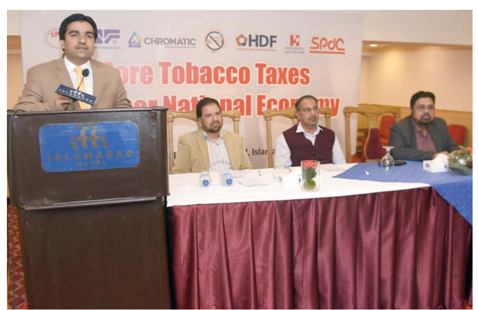
reduce counterfeiting, combat illicit trade, and ensure accountability.