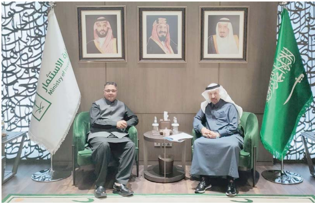
Muhammad Azfar Ahsan and H. E. Khalid Al-Falih expressed optimism about the prospects for deeper cooperation and mutual prosperity. They emphasized the enduring strength of the relationship between the two countries aimed at unlocking untapped potential and fostering sustainable economic development.