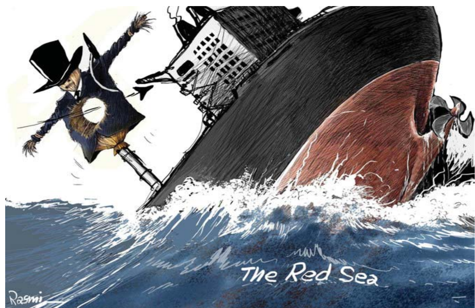
Cartoon by Amjad Rasmi. (Courtesy of Asharq Al-Awsat)