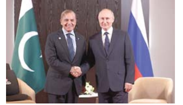
capacity as head of government, the Embassy of Russia in Islamabad said on its X timeline.

The Russian president highlighted the friendly nature of Russia-Pakistan relations and wished Shehbaz Sharif every success in his important