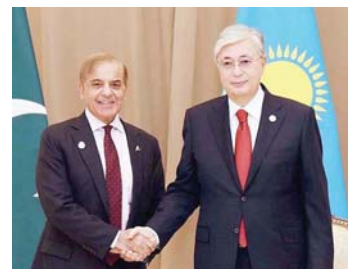
lic of Pakistan.

ASTANA, THE GULF OBSERVER: President Kassym-Jomart Tokayev of Kazakhstan has extended a heartfelt congratulatory letter to the newly appointed Prime Minister of Pakistan, Shehbaz Sharif. In his message, President Tokayev conveyed warm congratulations to Prime Minister Sharif on assuming the significant leadership role in the Islamic Republic of Pakistan.