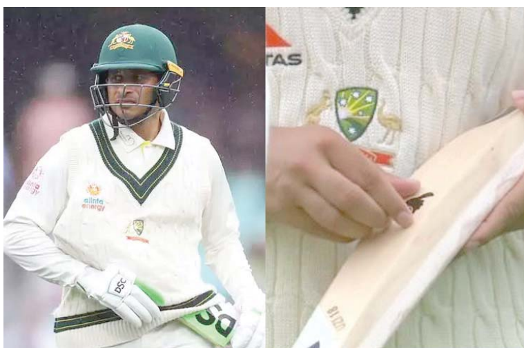
messages that relate to politics, religion or race.

It is pertinent to mention that the opening batter wanted to wear shoes emblazoned with the hand-written slogans "Freedom is a human right" and "All lives are equal" in the first Test of the three-match series against Pakistan in December. But he was told that it flouted International Cricket Council (ICC) rules on