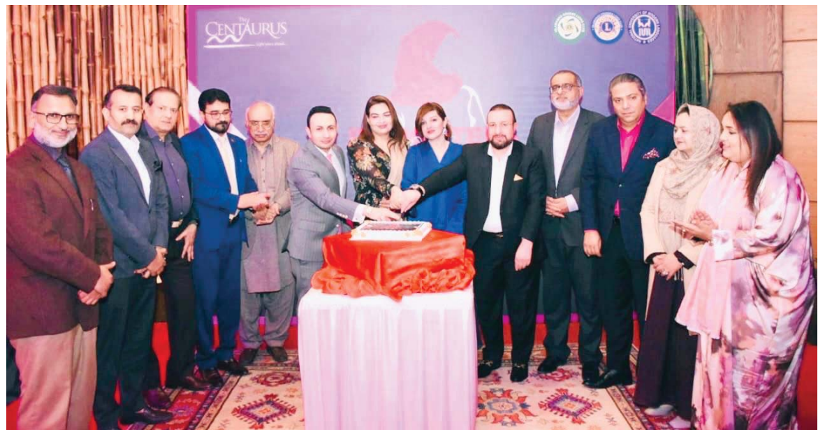
attended the event and along with SAPM distributed appreciation certificates and shields among the organizers of the event.