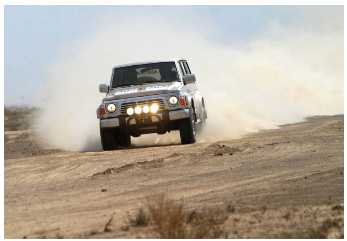
Umar Iqbal Kanju finished in 4 hours 54 minutes. And the third by covering the fixed distance in 10 seconds The number remains.

Haris Khan 5 hoursHe finished third in 19 minutes and 13 seconds. Similarly, Zafar Baloch finished the prescribed distance in 4 hours 42 minutes and 3seconds, Taj Khan finished second in 4 hours 52 minutes and 15 seconds, while