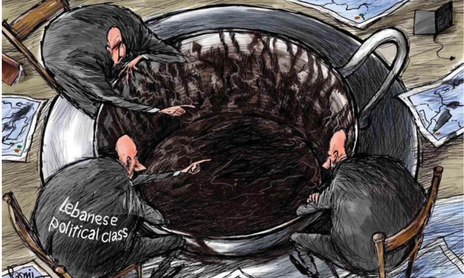
Cartoon by Amjad Rasmi.