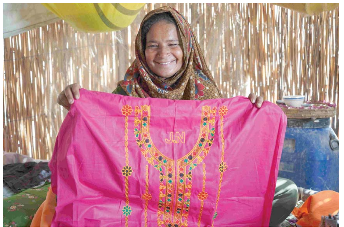
basin, was the worst-affected province, accounting for nearly 70 percent of total losses and damage.

More than 1,700 lost their lives in the 2022 floods which affected over 33 million people nationwide. The Sindh province, at heart of the Indus River