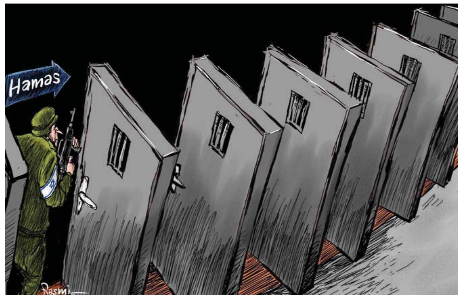
Cartoon by Amjad Rasmī.

This bilateral cooperation focuses on long-term development to gradually transfer the mature management experience of "tridimensional water management" of agricultural water conservation, safe drinking water for farmers, and rural sewage treatment to Belt and Road partners including Pakistan.