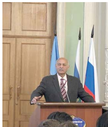
for Freedom of Nations Mr. Dmitriy Medvedev (Former President of Russian Federation).