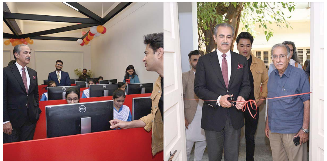
in enriching the educational landscape and fostering the holistic development of our students.

Zindagi Trust remains steadfast in its commitment to effecting transformative change through education and persistently endeavours to redefine the parameters of educational innovation. The operationalization of the inaugural Digital Arts Lab at SMB Fatima Jinnah Government Girls School stands as a testament to this unwavering dedication to providing students with a superior educational experience. Additionally, plans are underway for the establishment of a second Digital Arts Lab at Khatoon-e-Pakistan Government Girls School, reaffirming the organisation's pledge to extend high-quality educational opportunities to a broader spectrum of students. Commencing from the academic year of 2024, the Digital Arts Program will be implemented, marking a significant step forward