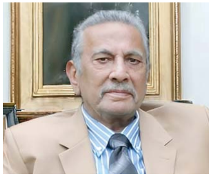
before the election.