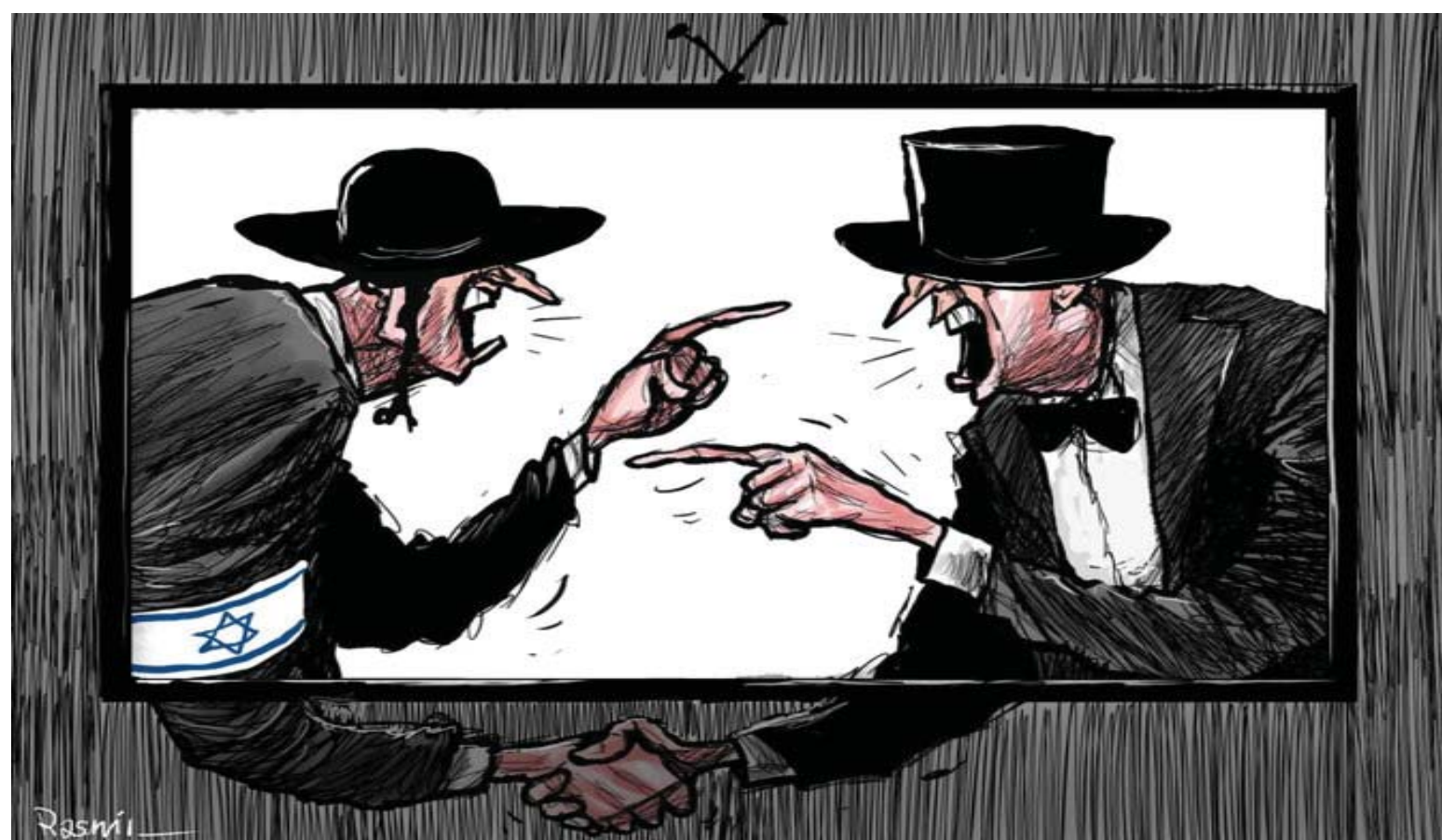
Cartoon by Amjad Rasmī.