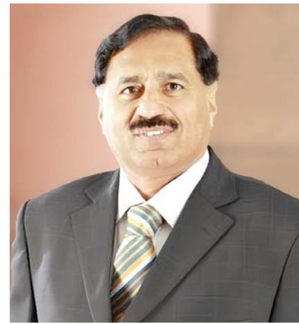
He said that in this grim scenario, the Special Investment Facilitation Council (SIFC) could play a crucial role in implementing necessary but unpopular decisions despite opposition from some quarters.

ment will face several daunting challenges. The most important is dealing with an economy still in the ICU and soaring inflation that has fuelled a cost-of-living crisis. It is believed that the new government will be unable to maintain the economic stability achieved by the caretaker government through unpopular decisions. He said that the new government would be unable to implement tax reforms, revive or sell lost state-run enterprises, and would not like to see further energy price hikes as decided by the IMF. The split mandate will hinder political and economic stability. It will also be challenging to sign another agreement with the IMF, which is necessary to save the country from bankruptcy. Politicians would focus on horse trading, keeping allies happy, and dealing with the opposition as they were handled, while economic stability would be outside their list of priorities.