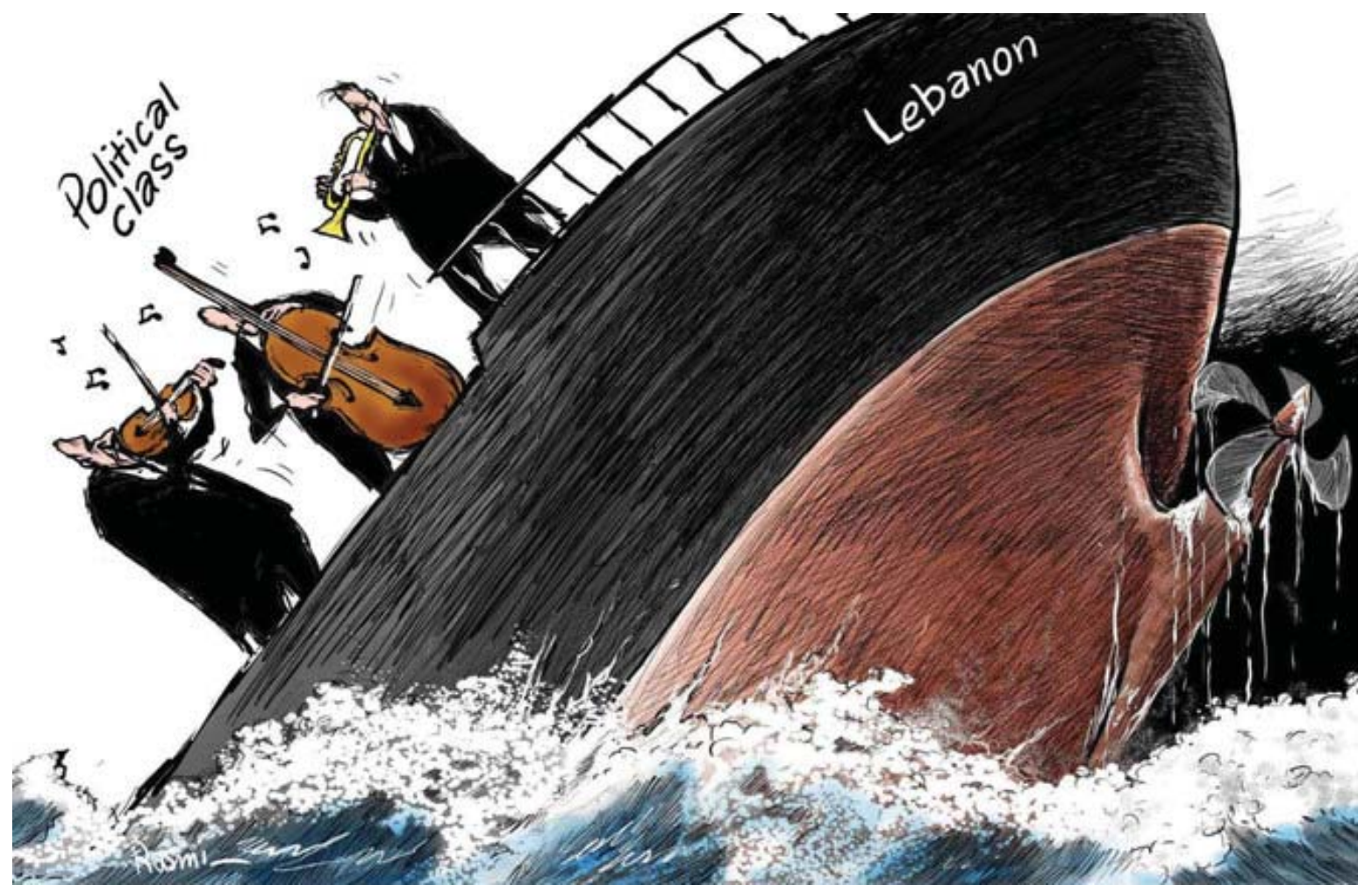
Cartoon by Amjad Rasmi.

The latest toll from the fighting in Gaza is at least 27,840 fatalities with more than 67,300 injured, according to the Palestinian health authority. As of 8 February, 225 Israeli soldiers have been killed with 1,314 injured in Gaza since the beginning of the ground operation, according to the Israeli military. UN humanitarian officials continued to highlight that the risk of famine in Gaza is increasing "by the day", particularly in northern Gaza. Hundreds of thousands of people there have been "predominantly cut off from assistance", OCHA said, despite the fact that this is where the greatest needs are, with many reportedly grinding animal feed to make flour. Since the onset of the crisis, the UN World Food Programme (WFP) has delivered 1,940 trucks - 19 per cent of all aid trucks, it said - carrying over 32,413 tons of lifesaving food supplies.