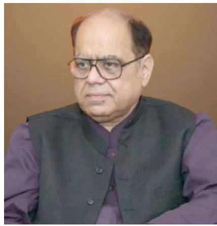
It seems that the PML-N and PPP will

He remarked that the establishment of coalition governments in the center of Punjab and Balochistan is written on the wall, which may impede development.