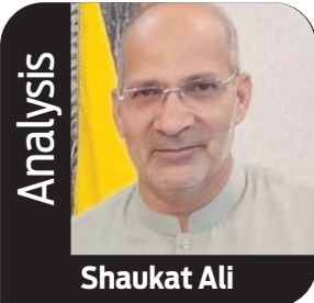
Analysis Shaukat Ali

On this International Day of Women and Girls in Science, let's reiterate this fundamental message: women need science, and science needs women. Only by tapping into all sources of knowledge, all sources of talent, can we unlock the full potential of science, and rise to the challenges of our time. (UNESCO)