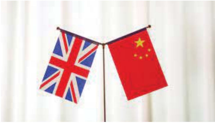
and Britain, which has promoted mutual benefit and win-win results

For a long time, the 48 Group Club has actively fostered economic and trade exchanges as well as people-to-people exchanges between China