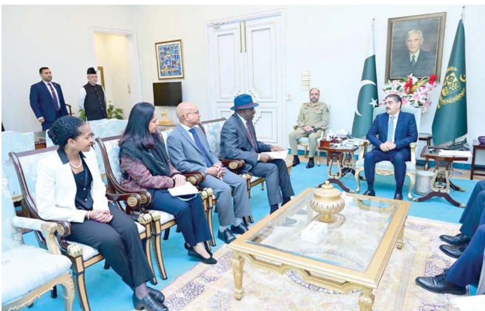
welcomed the COG delegation and said that Pakistan was proud to honour its commitment as a

Caretaker govt. ensures best arrangements for peaceful conduct of polls: PM The meeting was part of the COG's interaction with various stakeholders ahead of the upcoming general elections on February 8, 2024. The caretaker prime minister