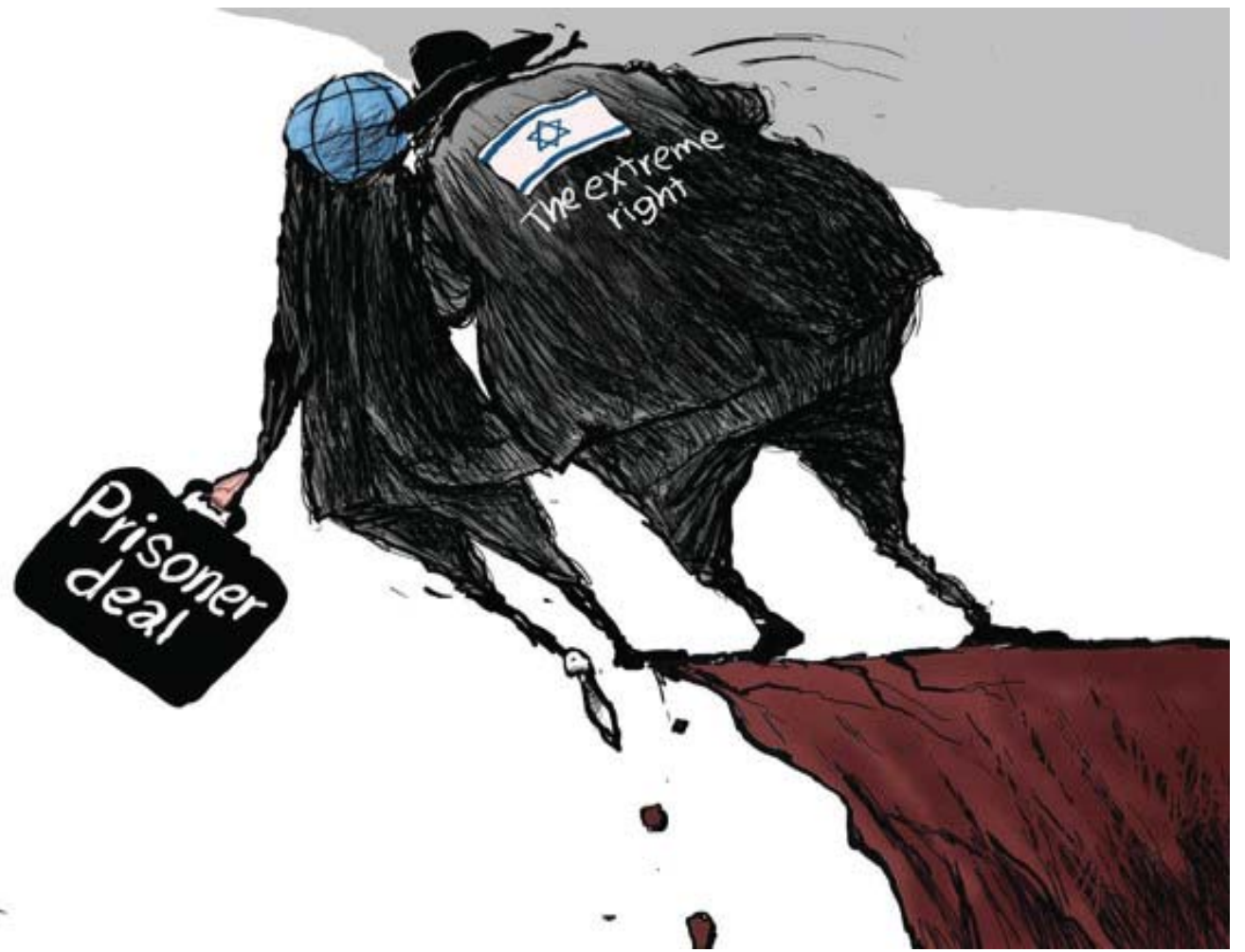
Cartoon by Amjad Rasmi. (Courtesy of Asharq Al-Awsat)