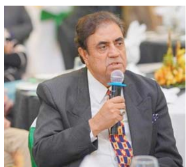
ties of life to people in remote areas in

He said the concerned non-governmental organisations and charities could play a vital role in providing quality education, health services, water supply, and other basic necessities