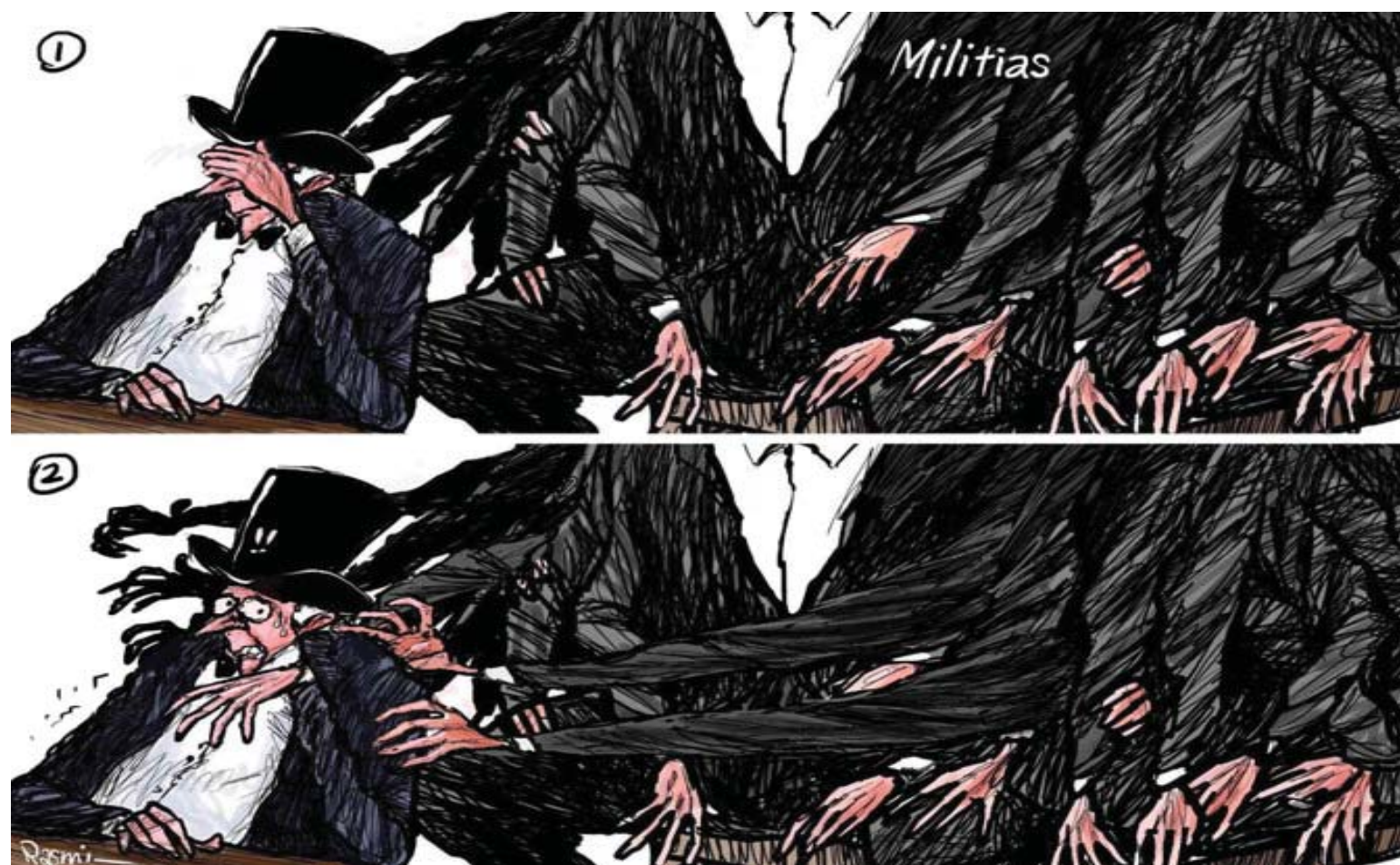
Cartoon by Amjad Rasmī.