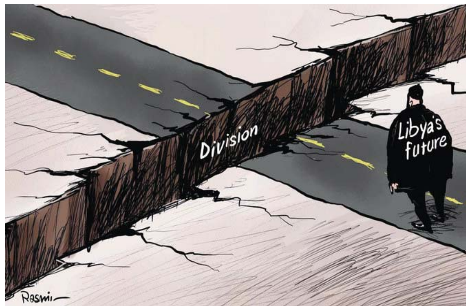
Cartoon by Amjad Rasmi.

The Israeli army is the only force known to have tanks operating in the Gaza Strip.