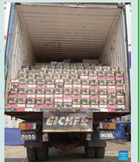
This photo shows a truck loaded with instant noodles to be exported to Japan via China, in Kathmandu, Nepal on Jan. 25, 2024.

Under the transit deals, China allows the landlocked country to use Tianjin, Shenzhen, Lianyungang and Zhanjiang as well as Lanzhou, Lhasa and Shigatse to handle traffic in transit.