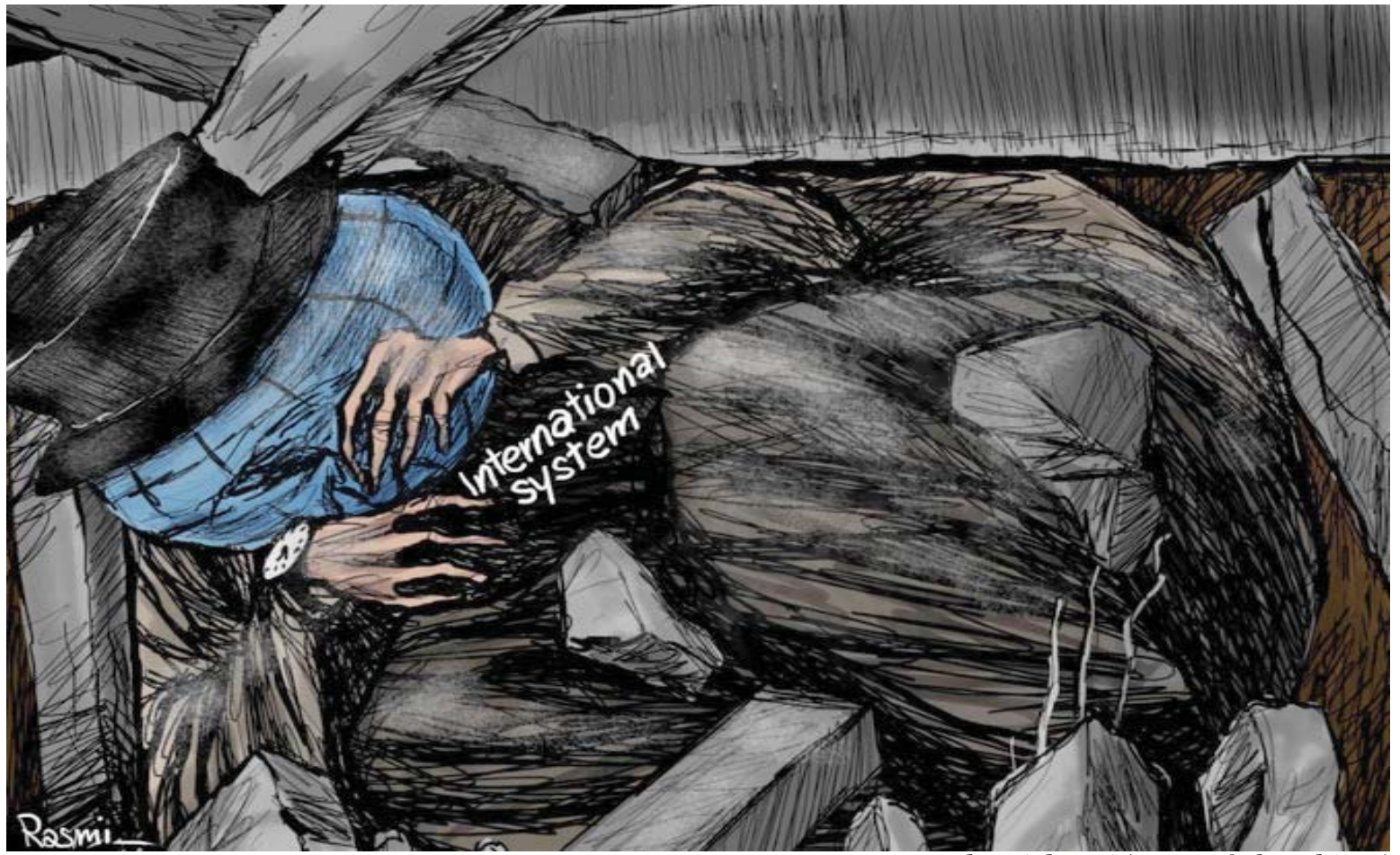
Cartoon by Amjad Rasmi.