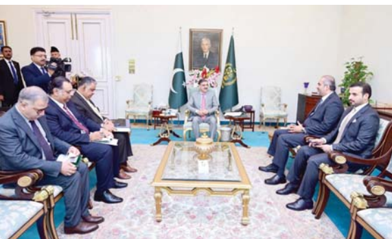
He expressed Pakistan's