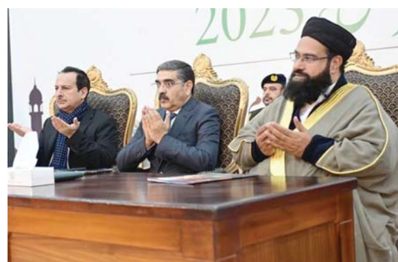
Prime Minister Kakar said.

"Don't our children have a right to live a healthy life and enjoy Allah's blessings as others do? This is their fundamental human right. Their right is our responsibility,"