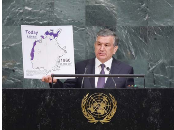
Desertification and a high-level meeting on combating sand and dust storms on November 13-17 in Samarkand. The resolution contains specific tasks to effectively counter climate and environmental threats in Central Asia, including through the development of sustainable agriculture, landscaping, rational use of water resources, energy efficiency, waste recycling, develop-

number of initiatives of the President of Uzbekistan, including the “Green Agenda for Central Asia” and its role in promoting sustainable development in the region. In the resolution, member states welcome the initiative of Uzbekistan to hold the International Climate Forum in Samarkand in 2024. Particular attention is paid to efforts to mitigate the consequences of the drying up of the Aral Sea, with special emphasis on the activities of the UN Multi-Partner Trust Fund for Human Security for the Aral Sea region, created on the initiative of the head of Uzbekistan. An appeal was made to the international community to continue to support this fund. The document notes the importance of introducing innovative methods and new technologies in the fight against desertification and land degradation. Contains greetings to the successful holding for the first time in Central Asia of the 21st session of the Committee to Review the Implementation of the UN Convention to Combat